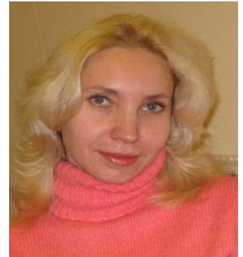
Dr.Oksana Sytar Ukraine